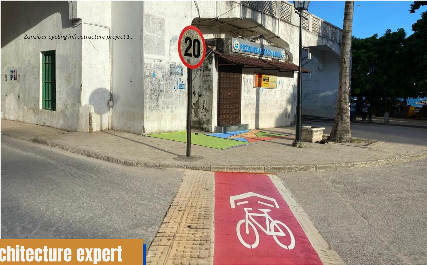
Zanzibar cycling infrastructure project 1..