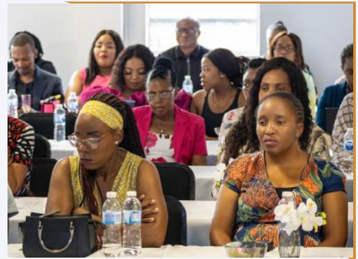
The first cohort of the Future Dealership Development Programme (FDDP) and their loved ones attending the programme graduation ceremony.

The inaugural Future Dealership Development Programme (FDDP), a significant milestone in empowering women within the automotive industry saw 20 dynamic women completing the programme, which equipped them with skills to become successful car dealership owners.